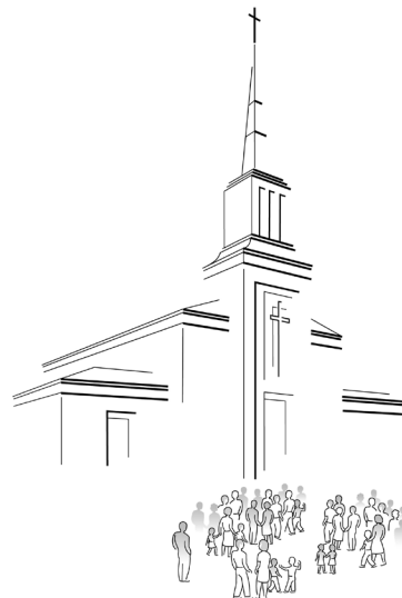
St. Dominic Parish Generations Growing in Faith

Our future depends on you. Please remember St. Dominic in your will and estate planning. Our legal title is St. Dominic Roman Catholic Church.