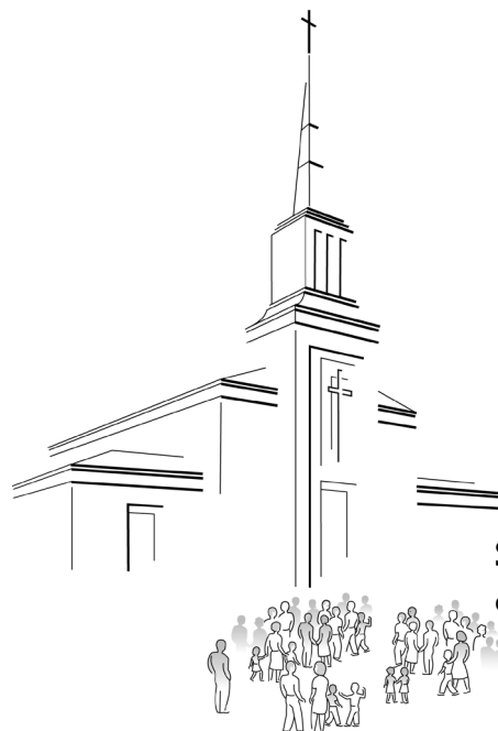
St. Dominic Parish

Please call the office 513-471-7741 or any member of the St. Dominic St. Vincent de Paul if you would like more information about this ministry.