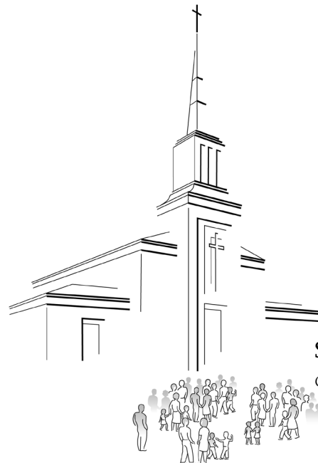
St. Dominic Parish

Make sure your voice is heard! Beacons of Light, the archdiocese-wide pastoral planning process currently underway, will result in all parishes being grouped into "Families" under the leadership of one pastor. A draft of this plan will be shared for public comment October 1-20 at www.BeaconsAOC.org . Do not miss this opportunity to provide your input to this important initiative which will shape the future of our archdiocese.