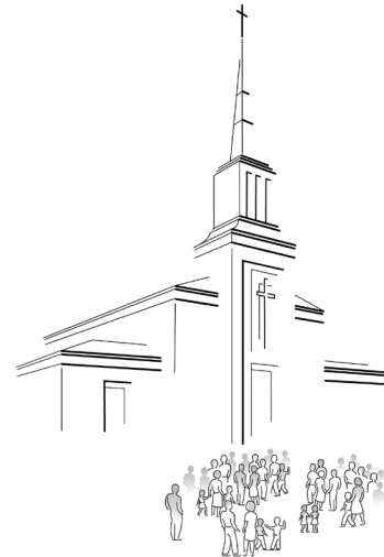
St. Dominic Parish Generations Growing in Faith