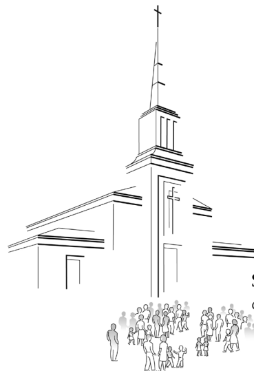
St. Dominic Parish Generations Growing in Faith

The second requirement for volunteers is to complete an online background check request. Payment for this is by credit card or "token" at the time of your online request. Contact the organization for which you volunteer to get information on obtaining a token for payment. To initiate the online background check, sign in to your VIRTUS.org user account, click the "Toolbox" tab then click the selection.com background check link. Call the Parish Office at 471-7741, ext. 0, with any questions.