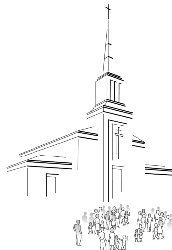
St. Dominic Parish Generations Growing in Faith

Quarterly Bulletins – Everyone registered with SafeParish should have received the first quarterly, video bulletin. This training bulletin must be completed by October 10, 2021 in order to remain active and in compliance with the Archdiocese of Cincinnati Child Protection Policy. St. Dominic's next compliance list will be posted on the website on October 11, 2021. Until then, refer to the current in compliance list. No one may work with children if they are not active and in compliance. If you did not get the bulletin, check your spam or junk mail. You can also sign into your account, go to the Training Tab and click on the "Due" link to see which bulletins are due and their due date.