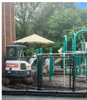
St. Dominic playground update