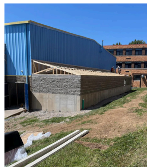
OLV gym expansion