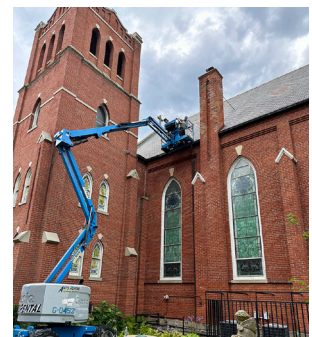
St. Al's church roof repairs