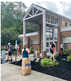
St. Simon Plagge Hall beautification

I noticed at home in Ireland that many of the public buildings with lawns and gardens are overgrown. This is not an oversight, nor is it due to lack of funds. Rather, it is an attempt to help sustain the native populations of flowers, birds, and insects. As you are probably aware there is a great danger concerning the loss of butterflies, bees, and native birds here in Ohio. Much of their natural habitat has been destroyed or poisoned. We are looking into the possibility of turning some of our unused green space into environmental habitat to help promote the return of our hard-hit native species. For example, the field behind the rectory at St. Simon and St. Vincent, and maybe even in front of the church at St. Simon, might be used as an environmental prairie area to encourage the growth of the butterfly, bee, and native bird populations.