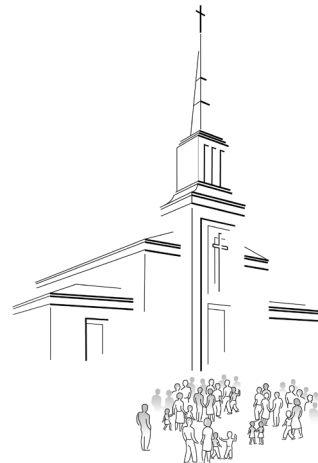
St. Dominic Parish Generations Growing in Faith