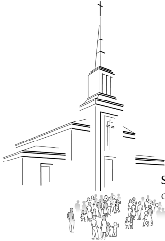
St. Dominic Parish Generations Growing in Faith