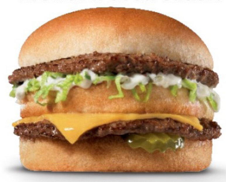
Join Frisch's in a fundraiser and enjoy great food at the same time!