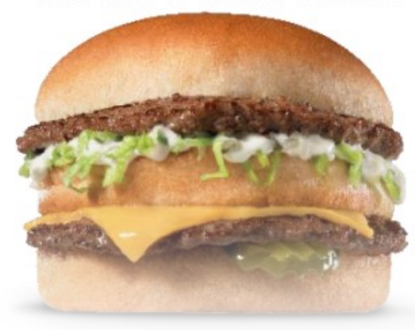
Join Frisch's in a fundraiser and enjoy great food at the same time!