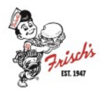
Delhi Frisch's 5202 Delhi Avenue Cincinnati, OH 43258

Present this printed flyer between 4:00-9:00 p.m. Valid for drive-in, carry-out and drive-thru only at the participating location listed below.