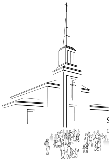
St. Dominic Parish Generations Growing in Faith

We've all forgotten to bring our envelope to Mass at times. If that happens, you are always welcome to mail it or bring it the following week, but there is another option. We have WELCOME envelopes at the entrances to church on the missalette racks for you to use. Write your name and phone number on the envelope and any contribution you make will be included on your annual contribution statement.