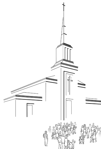
St. Dominic Parish Generations Growing in Faith

Make sure your voice is heard! A draft of this plan is available for public comment until October 20 at www.BeaconsAOC.org . Do not miss this opportunity to provide your input to this important initiative which will shape the future of our parish and archdiocese.