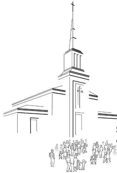
St. Dominic Parish

No one may work with children if they are not active and in compliance. If you did not get the bulletin, check your spam or junk mail. You can also sign into your account, go to the "Training" tab and click on the "Due" link to see which bulletins are due and their due dates.