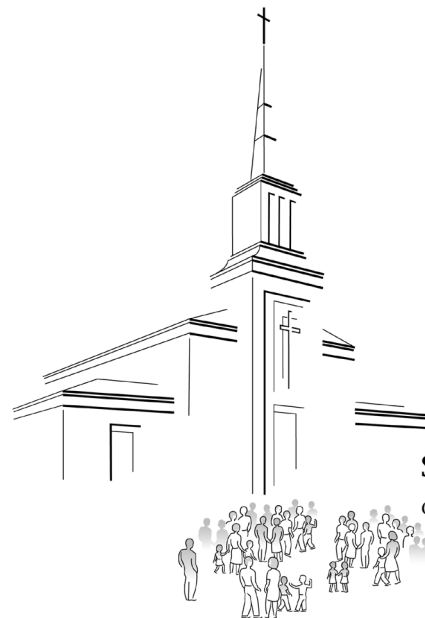
St. Dominic Parish