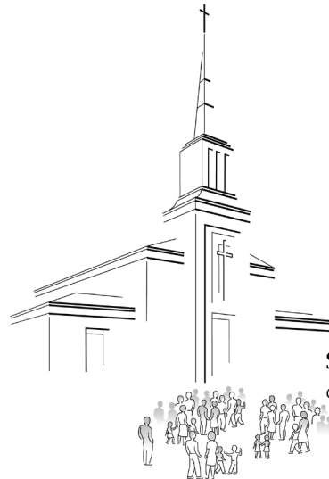
St. Dominic Parish