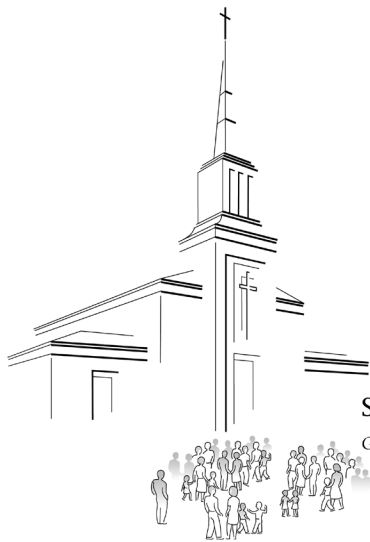
St. Dominic Parish

**Dinner will start at 5:00 beginning this month**