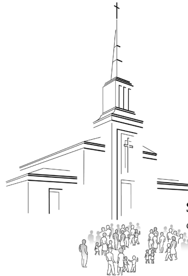
St. Dominic Parish

The information can be emailed to mariam@stdominicdelhi.org or call the Parish Office at 513-471-7741, ext. 410, by June 12.