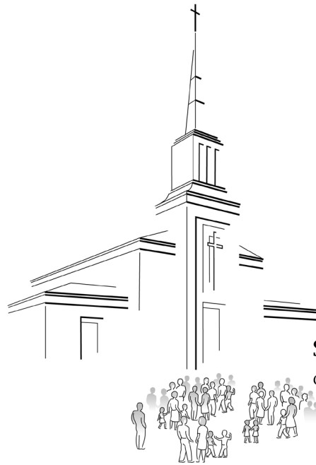
St. Dominic Parish