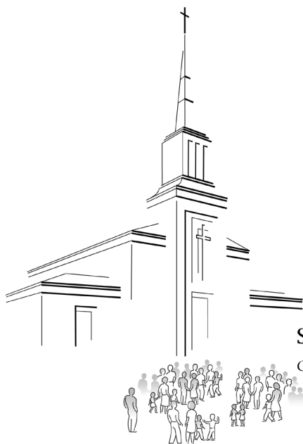
St. Dominic Parish

Envelopes for requesting a Votive Light are on the Communion railing near the Blessed Virgin Altar and close to the door as you exit by the Infant of Prague Statue. On the envelope you can designate an Intention. The usual donation is $2.00 to cover the cost of the candle. Candles are lit on Thursday for the week. Envelopes may be put in the collection basket on the weekend or brought to the Parish Office. If you have any questions, please call 471-7741, ext. 0.