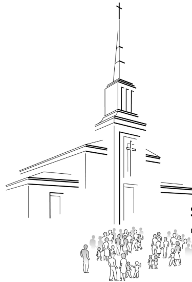
St. Dominic Parish Generations Growing in Faith

Are you age 70 ½ and required by the IRS to take annual distributions from your IRA account, also known as Required Minimum Distributions (RMD)? If so, you may consider making a Qualified Charitable Distribution (QCD) from your IRA account directly to St. Dominic Parish. QCDs will satisfy your annual distribution requirement (RMD) and will not be included in your taxable income for the year. This could be a great way to save taxes and financially support St. Dominic Parish. For more details on Qualified Charitable Distributions from your IRA account, please contact your investment advisor and/or your tax advisor as we cannot give specific tax advice.