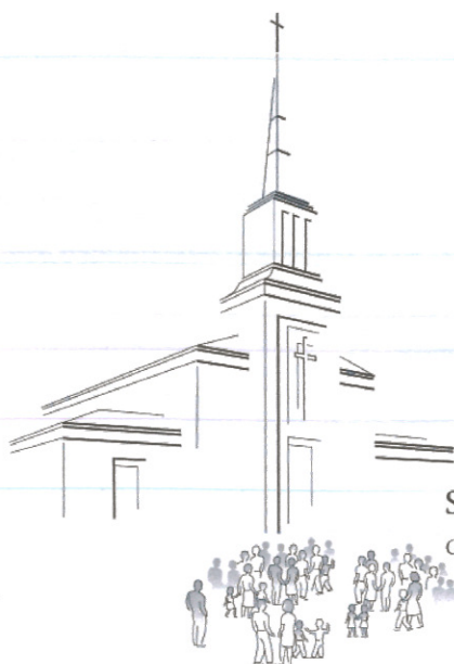
St. Dominic Parish