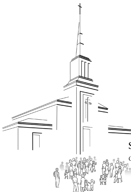
St. Dominic Parish

August 2 – Belterra Park and Casino. We chose this date, so we can also see the horse races. Detailed information will follow.