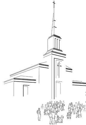
St. Dominic Parish Generations Growing in Faith

Our next Community Dinner is scheduled for July 18 in O'Connor Hall, 5:00 p.m. until 6:30 p.m. Hope to see everyone there!