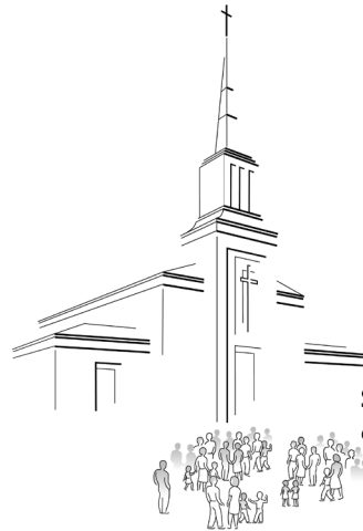
St. Dominic Parish Generations Growing in Faith

Our future depends on you. Please remember St. Dominic in your will and estate planning. Our legal title is St. Dominic Roman Catholic Church.