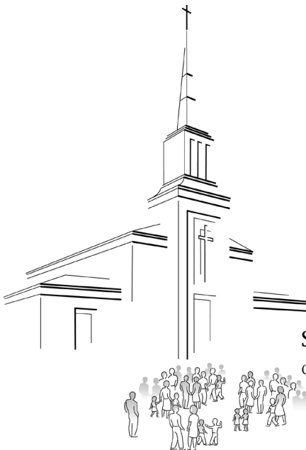
St. Dominic Parish Generations Growing in Faith