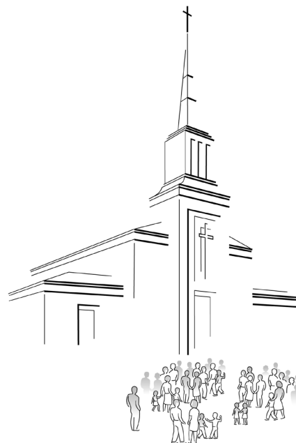
St. Dominic Parish Generations Growing in Faith

Prospective Preschool parents are invited to a very special evening on Wednesday, January 31, starting at 7:00 p.m. Meet the teachers, see the preschool rooms, and hear about our preschool program and what St. Dominic Preschool can do for your young child. We look forward to meeting you!