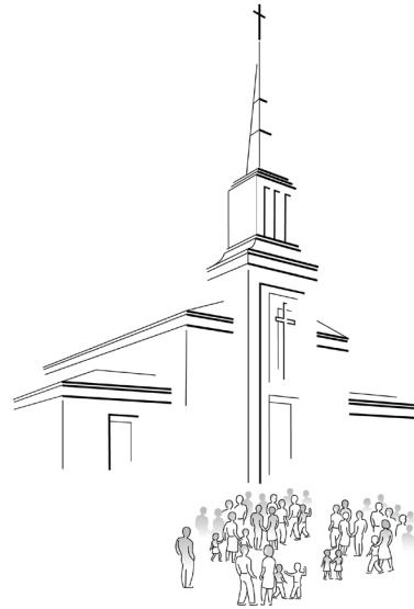
St. Dominic Parish Generations Growing in Faith

May the Lord continue to bless you in your generosity!