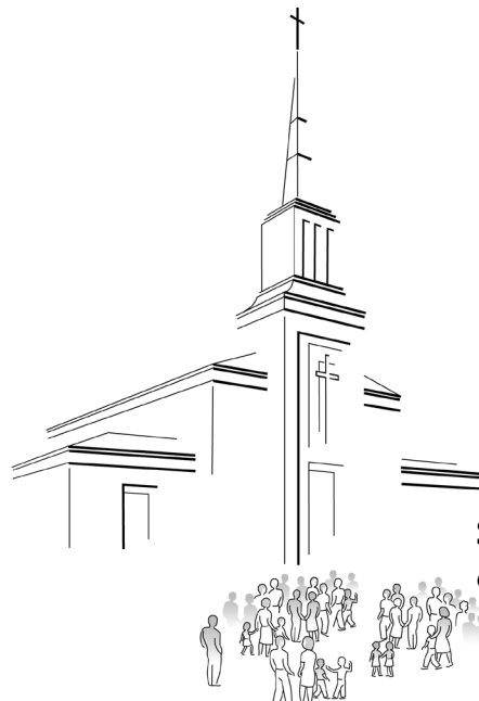
St. Dominic Parish Generations Growing in Faith