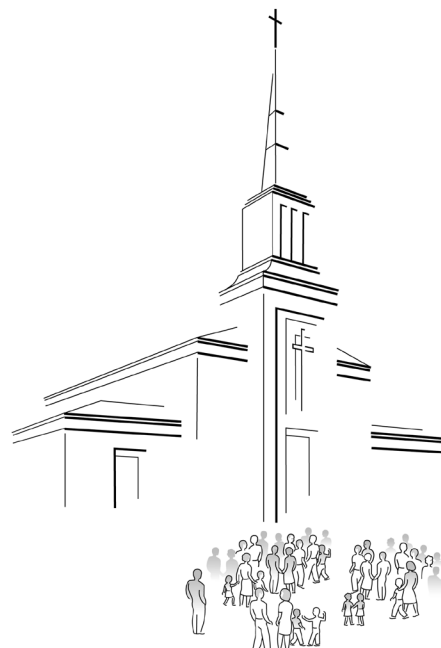
St. Dominic Parish Generations Growing in Faith