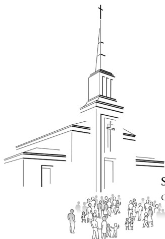
St. Dominic Parish Generations Growing in Faith